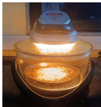
Fig. 1. Halogen air fryer equipment

substrate solution consisting of 0.98% (w/v) NaCl, 200 \mu L of Tween 20, and an olive oil-water mixture in a 1:3 ratio. The reaction mixture was incubated at 37 °C for 15 minutes, followed by heat inactivation in a water bath at 90 °C for 5 minutes. Subsequently, 5 mL of chloroform was added to the mixture, and it was allowed to incubate at room temperature for 30 minutes. To the lower phase, 2 mL of copper triethanolamine reagent, comprising 1 M triethanolamine, 1 N acetic acid, and 6.45% (w/v) copper nitrate, was thoroughly mixed. This resulted in two distinct color layers: an upper blue layer and a lower yellow layer. Next, 100 \mu L of 11 mM diethyl dithiocarbamate (DDC) was added to the lower yellow layer, and its absorbance was measured at 440 nm. A standard curve using oleic acid was prepared, and enzyme activity was determined in terms of mM free fatty acids released per minute per mg of soluble protein.